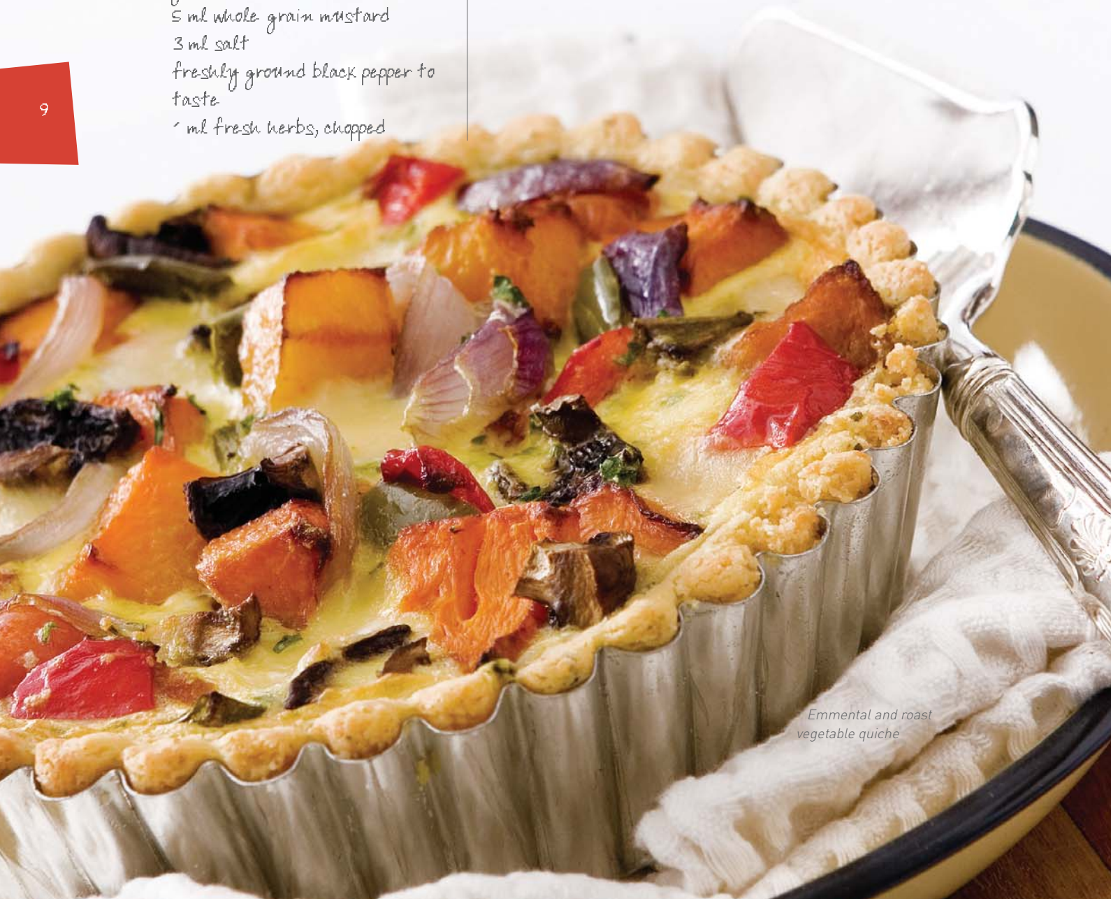
Emmental and roast vegetable quiche