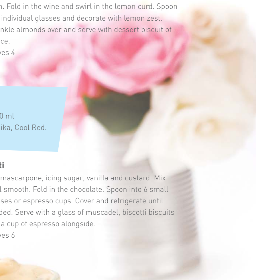
Quick custard creams with biscotti